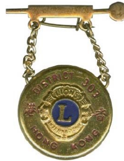
1972 Red Lettering