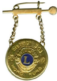
1971 Gold Lettering