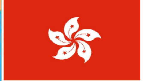
Flag of Hong Kong

Macau is a Special Administrative Region (SAR) of the People's Republic of China . In 1557 it was leased to Portugal as a trading post in exchange for an annual rent of 500 tael in order to stay in Macau, it remained under Chinese sovereignty and authority until 1887, the Portuguese came to consider and administer it as a de facto colony. Following the signing of the Treaty of Nanking between China and Britain in 1842, and the signing of treaties between China and foreign powers during the 1860s, establishing the benefit of "the most favoured nation" for them, the Portuguese attempted to conclude a similar treaty in 1862, but the Chinese refused, owing to a misunderstanding over the sovereignty of Macau. In 1887 the Portuguese finally managed to secure an agreement from China that Macao was Portuguese territory. In 1999 it was handed over to China. Macau was the last extant European territory in continental Asia.