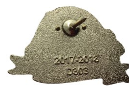
2018 Reverse Variation